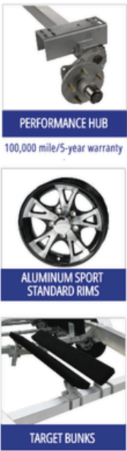
PERFORMANCE HUB 100,000 mile/5-year warranty