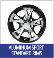
ALUMINUM SPORT STANDARD RIMS