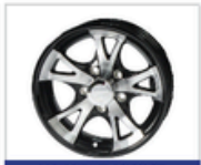
ALUMINUM SPORT STANDARD RIMS