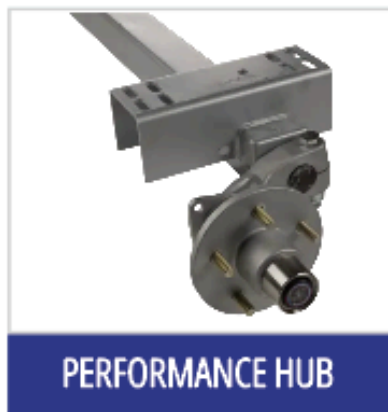
PERFORMANCE HUB 100,000 mile/5-year warranty

Smoother ride than springs and more corrosion resistant