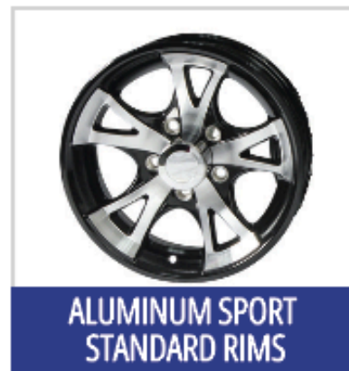
ALUMINUM SPORT STANDARD RIMS